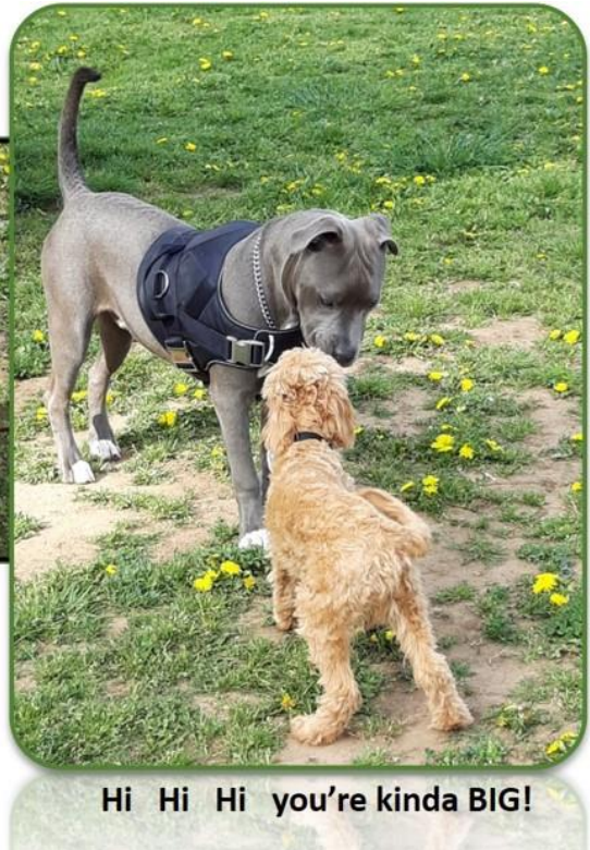
Hi Hi Hi you're kinda BIG!