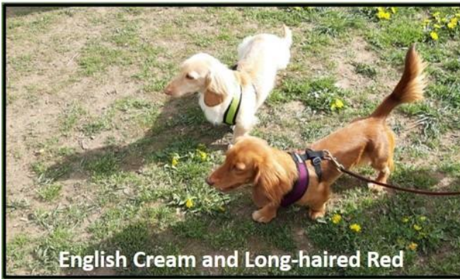
English Cream and Long-haired Red